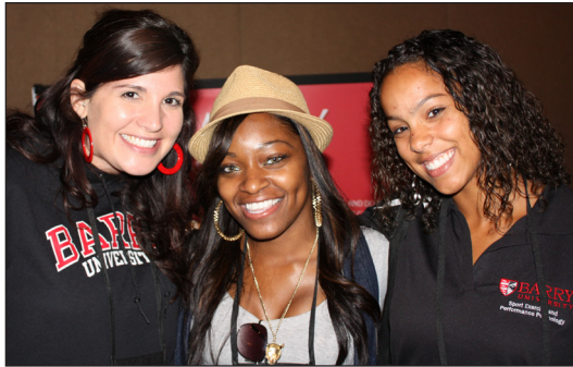
Barry University students enjoying the Graduate Program Fair.