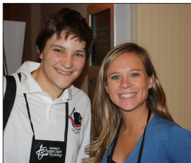
Two student members at AASP 2012.