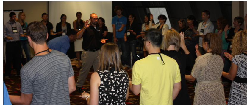
Bringing Sport to Life: Using Experiential Learning to Enhance Sport Psychology Team Workshops

Conference programming began in earnest on Wednesday afternoon with three consecutive blocks