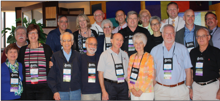
AASP Past Presidents during their annual luncheon.